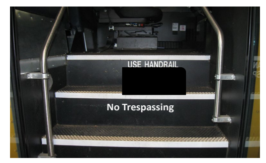
Separated decal location higher, out of the kick zone

Entrance step shall extend below skirt line to such depth as necessary to make the distance to the ground from the bottom of the step no less than 10 inches and no more than 14 inches.